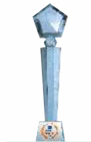
BEST IN ONGOING TEACHER ENHANCEMENT (Scoopnews Awards)