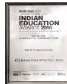
K12 SCHOOL CHAIN OF THE YEAR - NORTH (Franchise India)