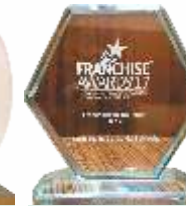
FRANCHISOR OF THE YEAR - K12 (Franchise Awards)