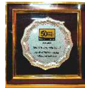
TOP 50 SCHOOLS IN INDIA (Fortune Magazine)