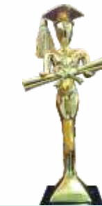
SCHOOL CHAIN OF THE YEAR (ELETs) (World Education Summit 2019)