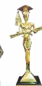
EDUPRENEUR OF THE YEAR (ELETs Awards)