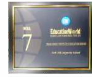
7th INDIA'S MOST RESPECTED EDUCATION BRAND (Education World 2019)