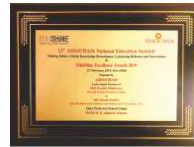
MOST PREFERRED SCHOOL CHAIN (12th ASSOCHAM National Education Summit)