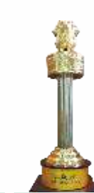
EDUCATION ICON OF THE YEAR (Education Today Awards)