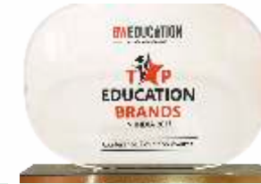
FRANCHISOR OF THE YEAR - K12 (BW Education Awards)